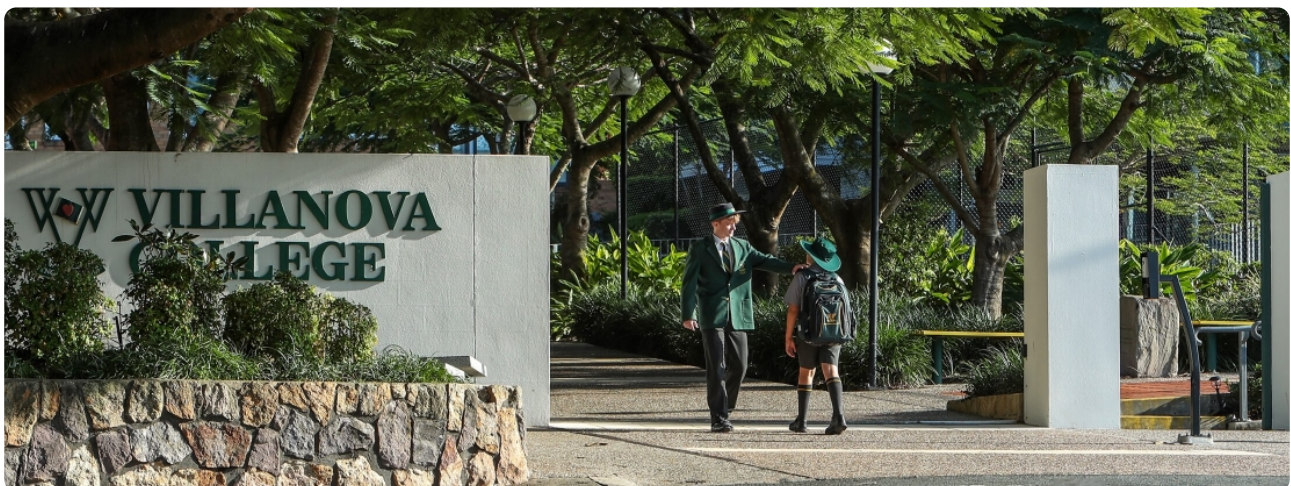
Villanova College – Coorparoo, Brisbane. An Augustinian Catholic school for boys, Years 5 to 12.