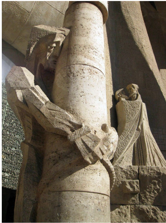
Jesus is scourged [whipped] at the gates of Jerusalem – from the Passion entrance at La Sagrada Família - Barcelona

John 19:1-3: "Then Pilate took Jesus and scourged him. And the soldiers plaited a crown of thorns, and put it on his head, and arrayed him in a purple robe; they came up to him, saying, 'Hail, King of the Jews!' and struck him with their hands".