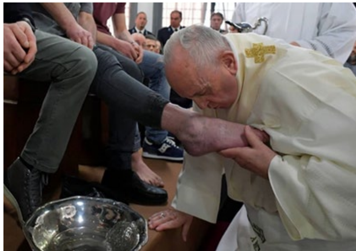
Truly understood, the Stations of the Cross are the way of love.

These powerful moments leading to Jesus's death are collectively known as the Stations of the Cross because many Christians pause to reflect on these moments.