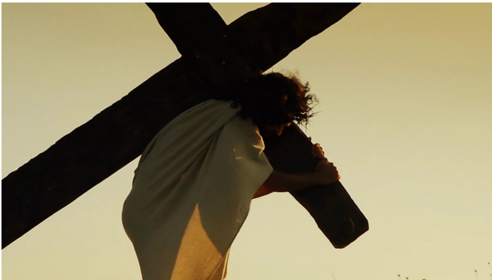
Jesus takes up his Cross.

“No one may cross the sea of his age, unless he be carried by the Cross of Christ... So do not forsake the Cross, and the Cross will carry you.”