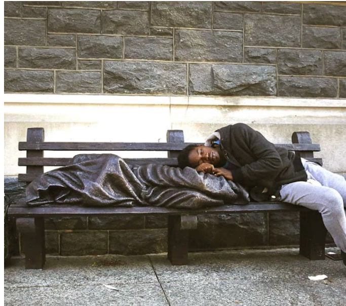
Statue of the homeless Jesus

We adore You, O Christ, and we praise You – Because by Your holy Cross You have redeemed the world.