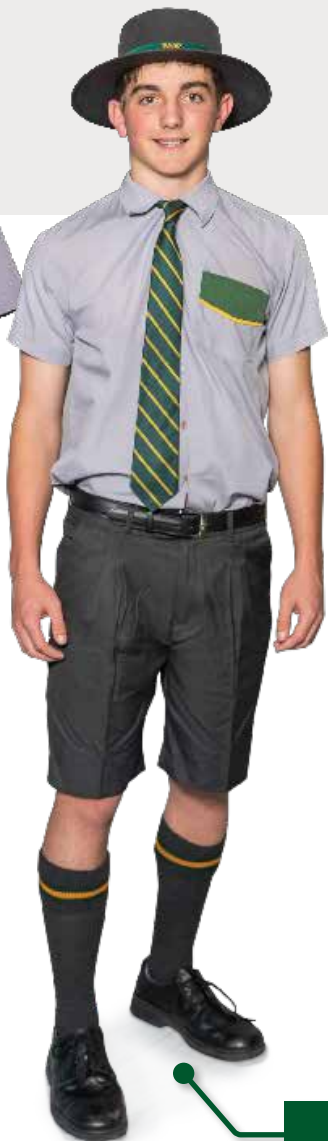
Summer Years 10 & 11