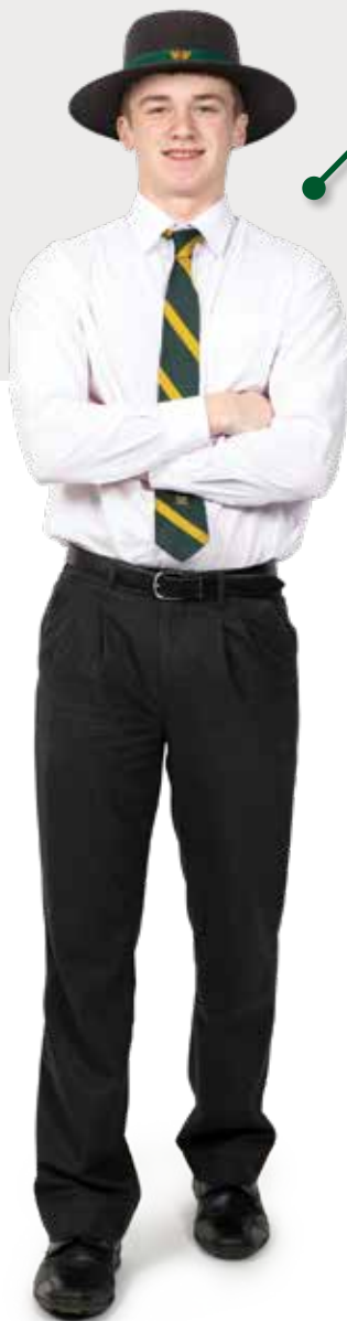
Summer Year 12