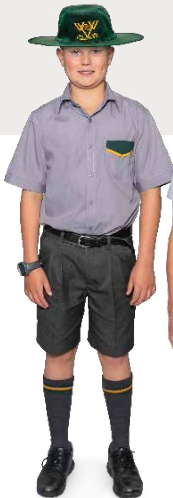
Summer Years 5-9