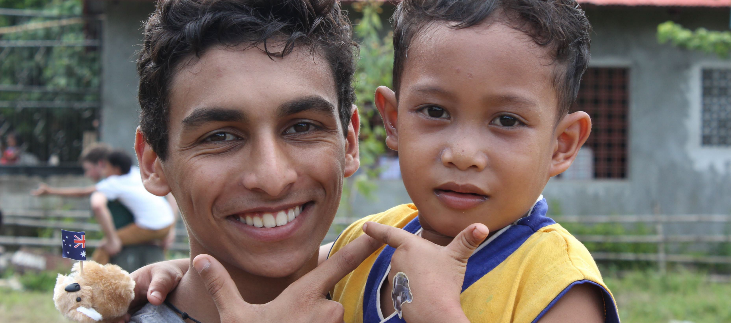
Mission Day Red candle week 2019