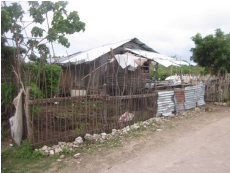
Electrical Repair Store.