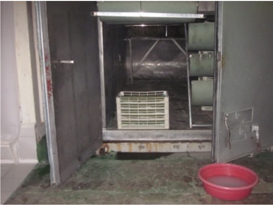
One of the finished products